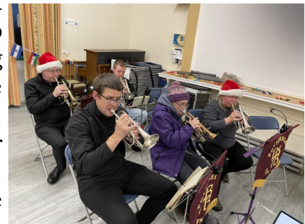
Back in the church hall