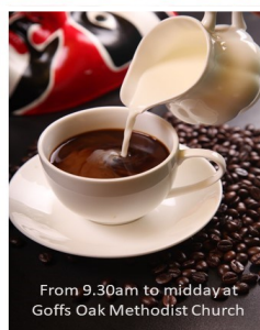
From 9.30am to midday at Goffs Oak Methodist Church

Every Wednesday, between 9.30am and 3.00pm, this building is a ‘Welcome Space’