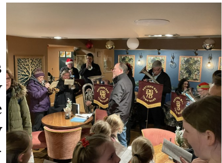
In the pub