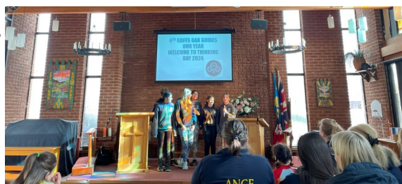
The Guides talk the congregation through the Thinking Day theme in March

We used one of our 'local arrangement' services to put on a ' Café Church ' style of worship. During this service in April we explored our understanding of who Jesus is, using materials from the Junior Alpha course, whilst enjoying coffee and a variety of tasty delights.