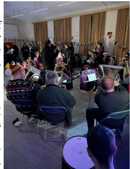
In the church hall